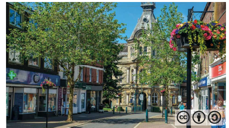
Looking along Fore Street, Tiverton town centre, by Lewis Clarke